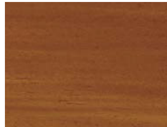
Dark Oak CC