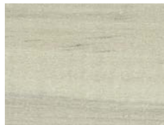
Frosted White TB