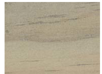
Silver Fir TB

Note: As a semi transparent stain, the final appearance of NaturalStain is affected by many factors including the timber species and unique characteristics of timber within the species. The colour and timber species combinations above should be used as a guide only. To see what your unique timber species and colour combination would look like, pick up a 250ml sample pot to trial.