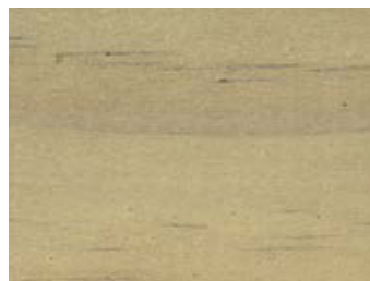
Bondi Sands TB