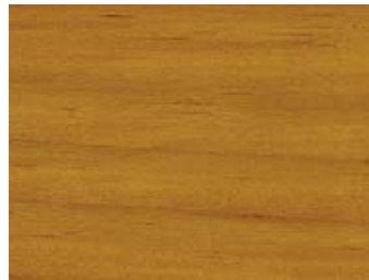
Light Oak CC